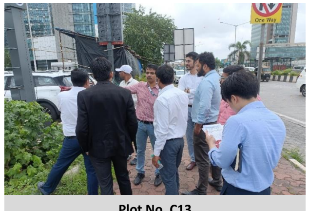
Plot No. C13